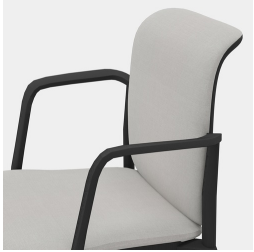
Ergonomically shaped backrest