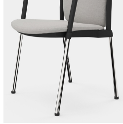
Robust 4-leg frame