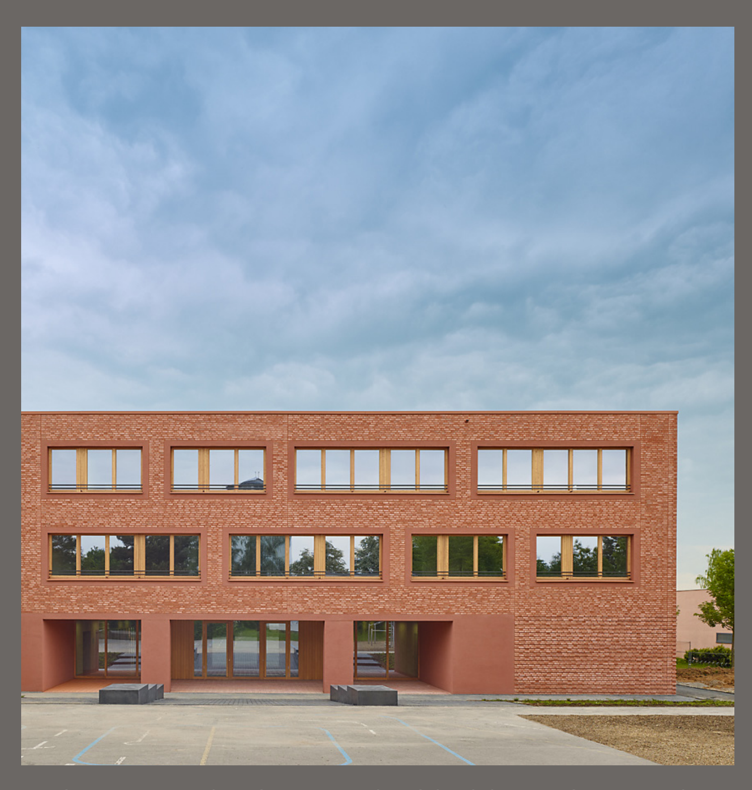
FIRSTWALD PROTESTANT HIGH SCHOOL, KUSTERDINGEN