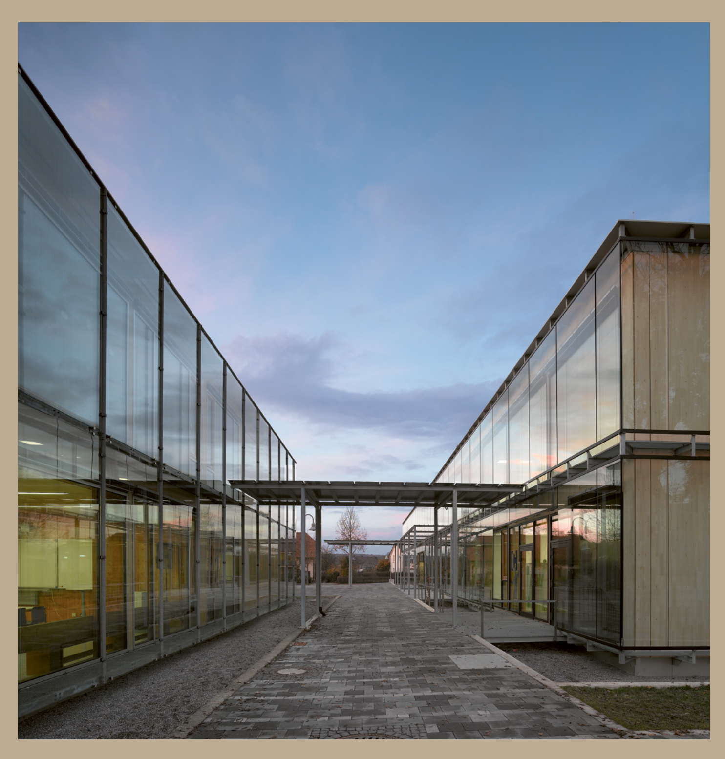
STEISSLINGEN COMMUNITY SCHOOL