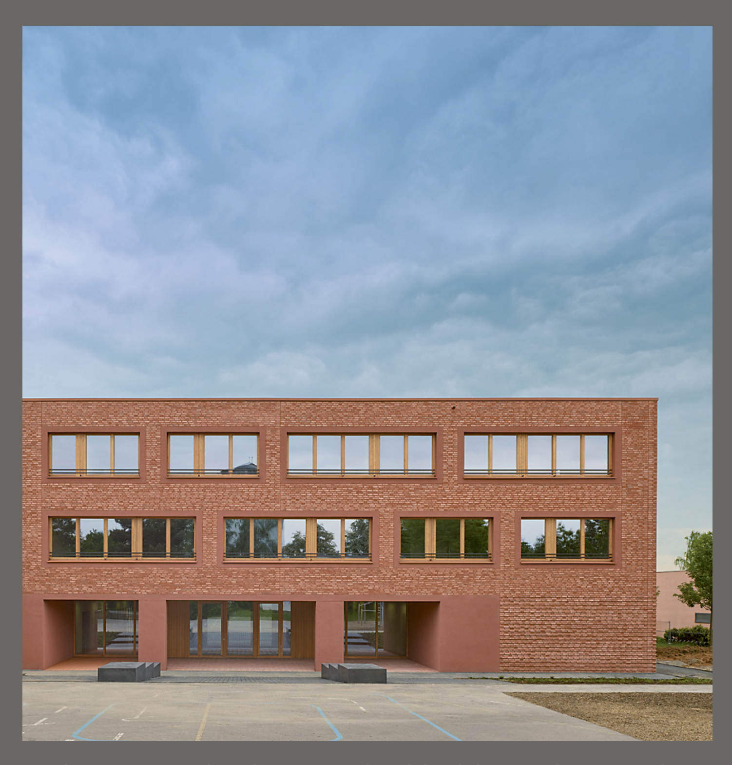
FIRSTWALD PROTESTANT HIGH SCHOOL, KUSTERDINGEN