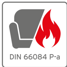
Optionally fire protection certified according to DIN 66084 P-a with cover fabric B1