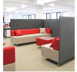
Individually extendable through interlinkable elements