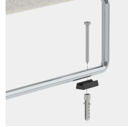
Optionally with screwed or glued floor fastening