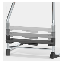
Tool-free adjustment of the footrest with only one hand