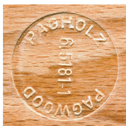
PAGHOLZ® from sustainable forestry