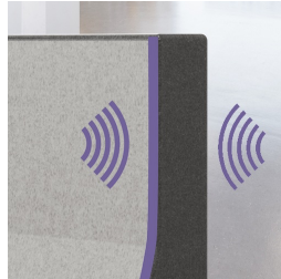
Sound insulation through sound-absorbing foam in backrest