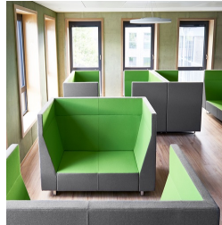
Ideal as a room-in-room solution