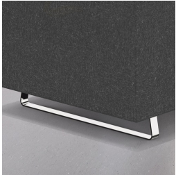
Stable sled frame