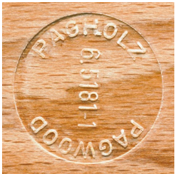
PAGHOLZ® from sustainable forestry