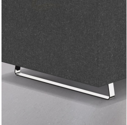
Stable sled frame