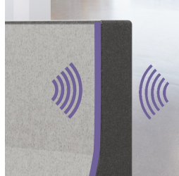
Sound insulation through sound-absorbing foam in backrest