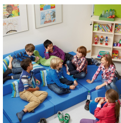
Versatile use due to fold-out function