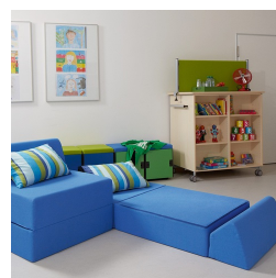
Space saving stowable

Our range of materials and colors can be found in the A2S material overview.