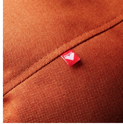
Durable due to high quality workmanship