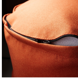
Cover removable by zipper