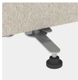
Rotatable base with plastic feet