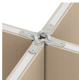
Up to four walls can be linked in one point