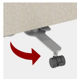
Rotatable base optionally with casters