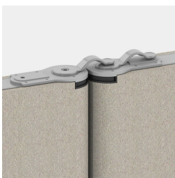
Patented connecting element for linking without tools