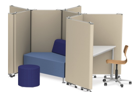
Flexible zoning of the room

Our range of materials and colors can be found in the A2S material overview.