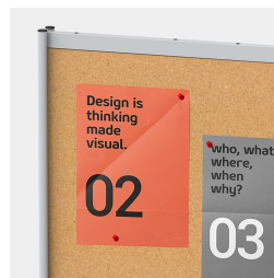
Optional covering in natural cork or cork linoleum