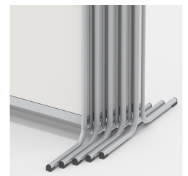
Can be nested to save space for storage

Our range of materials and colors can be found in the A2S material overview.