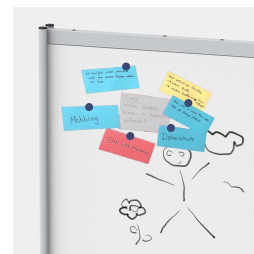
Magnetic surface can be written on with whiteboard pens