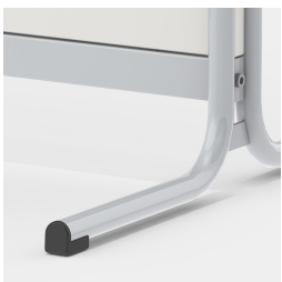
Base with plastic floor protectors