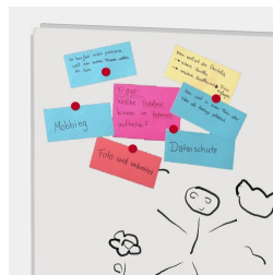
Magnetic surface can be written on with whiteboard pens