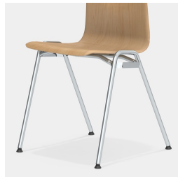
Robust 4-leg frame