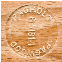
PAGHOLZ® from sustainable forestry