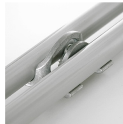
Optionally with row connection from size 5