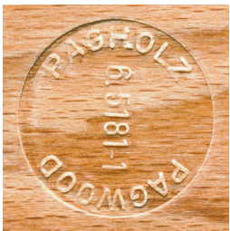
PAGHOLZ® from sustainable forestry