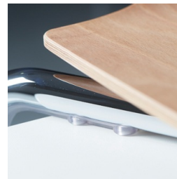
Plate and edge protectors protect the table when it is upended