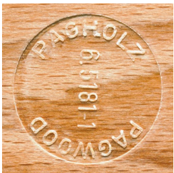
PAGHOLZ® from sustainable forestry