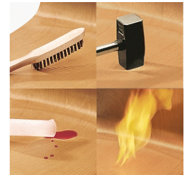
Indestructible PAGHOLZ® shell, scratch, break and impact resistant; flame retardant