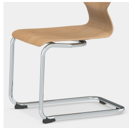
Robust cantilever frame