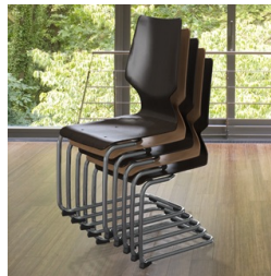
Stackable up to 5 chairs (without upholstery)