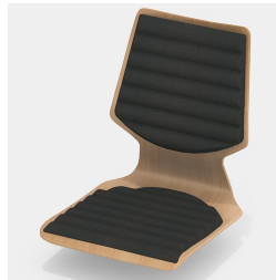
Optionally with seat and back wawe upholstery