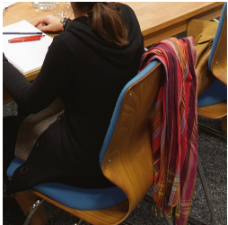
Particularly high backrest increases seating comfort