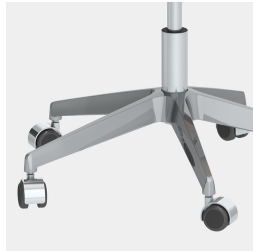
Extremely robust aluminum base