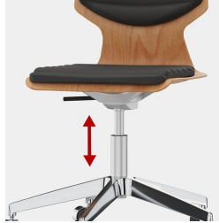
Height adjustment by safety gas spring