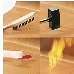
Seat and back melamine coated: scratch, break and impact resistant; flame retardant