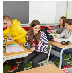
No disturbance of the chair legs when getting in and out of the chair