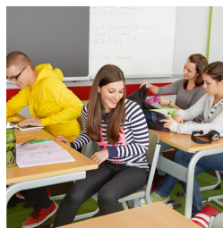
No disturbance of the chair legs when getting in and out of the chair