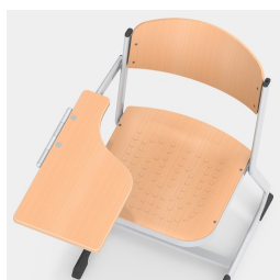
Stable and solid C-shape frame with writing surface