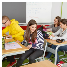
No disturbance of the chair legs when getting in and out of the chair