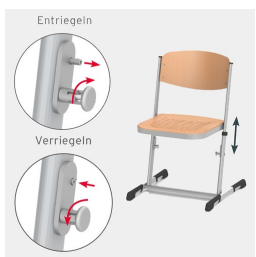
Multiple height adjustable through simple safety adjustment