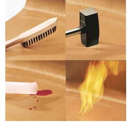
Seat and back melamine coated: scratch, break and impact resistant; flame retardant