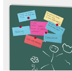
Magnetic surface can be written on with chalk