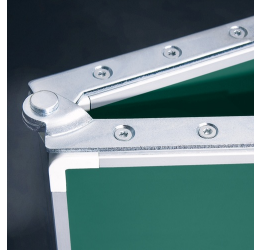
Panel wings can be folded out at 180° angle