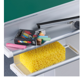
Eraser and pen tray included