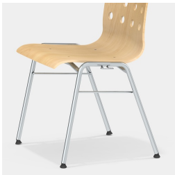
Robust 4-leg frame