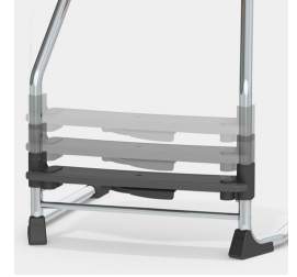
Tool-free adjustment of the footrest with only one hand