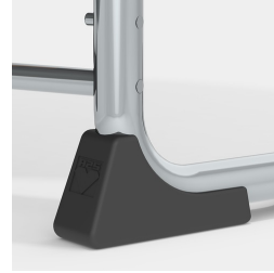
Tilt protection due to special floor protectors