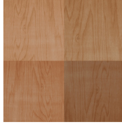
Colour deviations possible