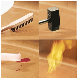
Indestructible PAGHOLZ® shell, scratch, break and impact resistant; flame retardant