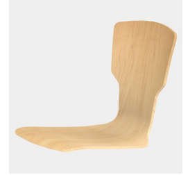
Body contoured seat shell