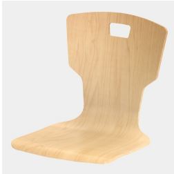
Optionally with handle hole in trapezoidal shape (not with backrest upholstery)