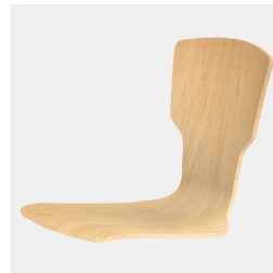
Body contoured seat shell