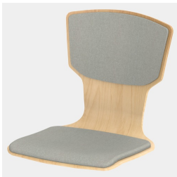
Optionally with seat and backrest upholstery