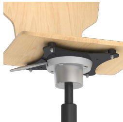
Optionally with 3D rocker