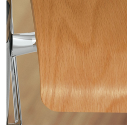
Seat shell environmentally friendly lacquered with water-based varnish