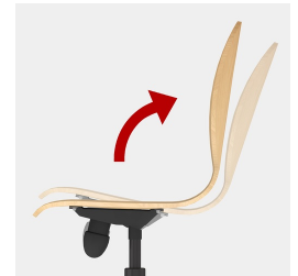
Optionally with 2D rocker