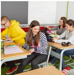
No disturbance of the chair legs when getting in and out of the chair