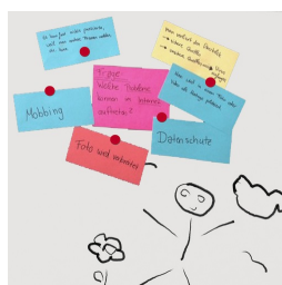
Magnetic surface can be written on with whiteboard pens