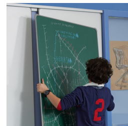
Removable board elements