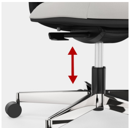
Stepless gas lift height adjustment includes seat depth suspension