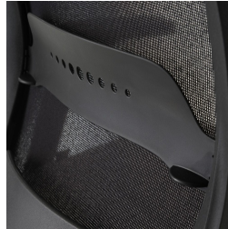
Black mesh backrest, with lumbar support adjustment