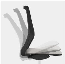
Self-weighting synchronous mechanism automatically adjusts spring force or resistance