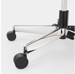
Elegant, high-quality aluminum base