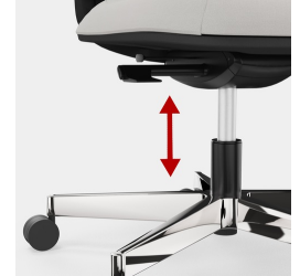
Stepless gas lift height adjustment includes seat depth suspension