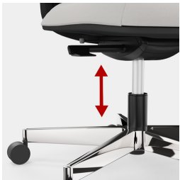
Stepless gas lift height adjustment includes seat depth suspension