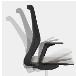
Self-weighting synchronous mechanism automatically adjusts spring force or resistance