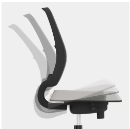
Self-weighting synchronous mechanism automatically adjusts spring force or resistance