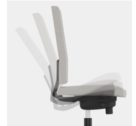
Self-weighting synchronous mechanism automatically adjusts spring force or resistance