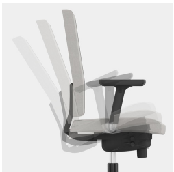
Self-weighting synchronous mechanism automatically adjusts spring force or resistance