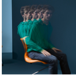
3D movement through Z-frame supports the toning of the muscles