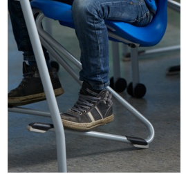
Robust Z-shape frame with A2S FLOORSAFE® floor protectors