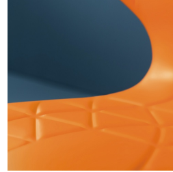
Seat shell with integrated ventilation channel