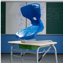
Plate protectors protect the table when stacking up