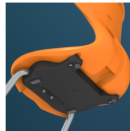
Concealed seat pan fastening protects the table when it is upturned