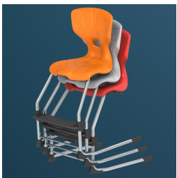
Stackable up to 3 chairs