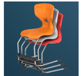
Stackable up to 3 chairs