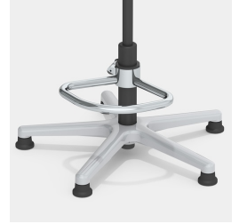
Optionally with partial foot ring