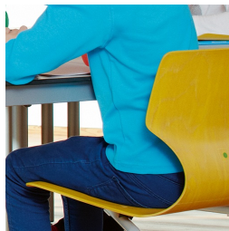
Ergonomically and orthopedically adapted shell shape