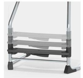
Tool-free adjustment of the footrest with only one hand