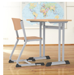
Due to C-shape no disturbance of the table legs when getting in and out of the table